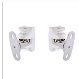
Includes optional dual point adaptor