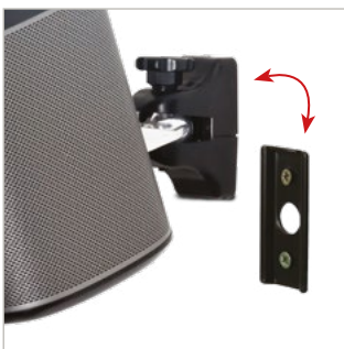
Simple 'hook-on' installation