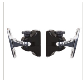
Supplied in pairs