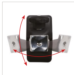
Thumbwheel for easy tilt and swivel adjustment