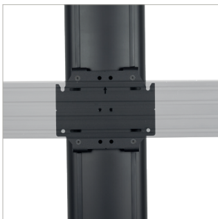
Designed to connect a BT8390 mounting rail to Mode-AL Vertical Columns.