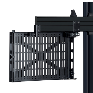
Use BT8385-RTC alongside BT8390 Mounting Rail to fit a BT7884 Flip Down Storage Tray to a Mode-AL Vertical Column.