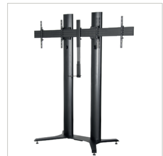
Two BT8385-RTC are required to fit a mounting rail across a twin column install.