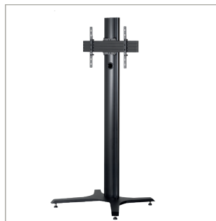
One BT8385-RTC is required to fit a mounting rail across a single column install.