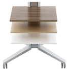
X SHELF - WHITE