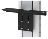
X FLEXIBLE CAMERA SHELF